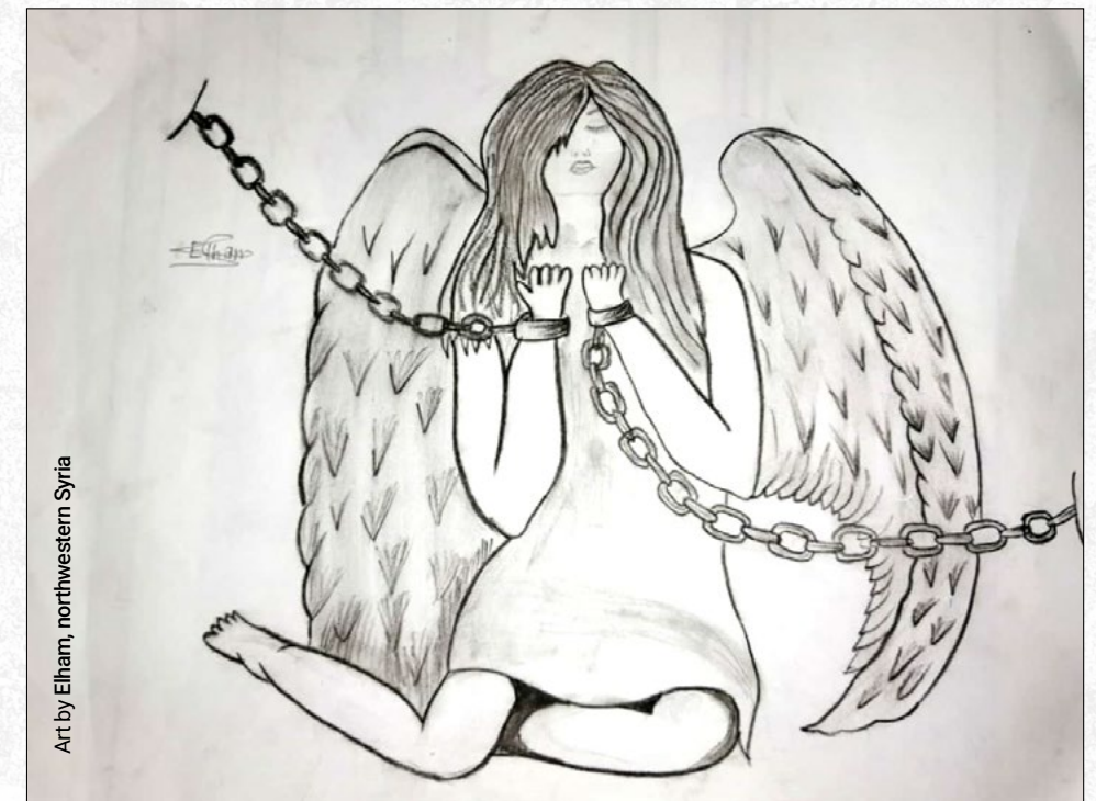
Art by Elham, northwestern Syria