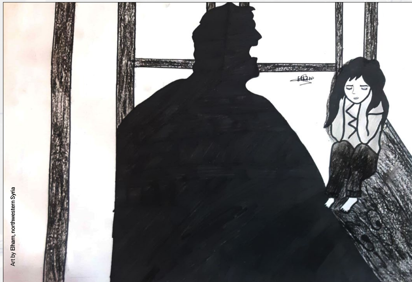
Art by Elham, northwestern Syria