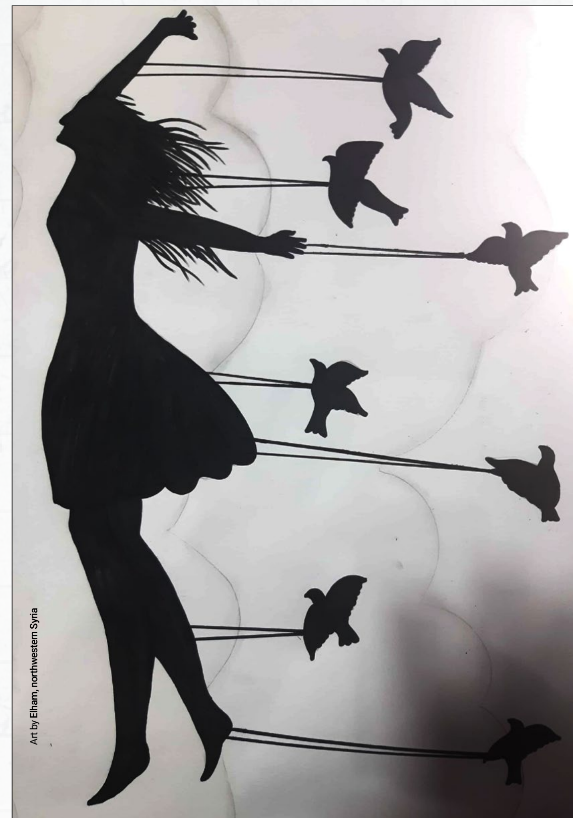
Art by Elham, northwestern Syria

We hope the narratives provided will serve to highlight the experiences of adolescent girls in the region, the inherent power they have to effect real social transformation, and the value of supporting programmes that allow them to tap into that power.