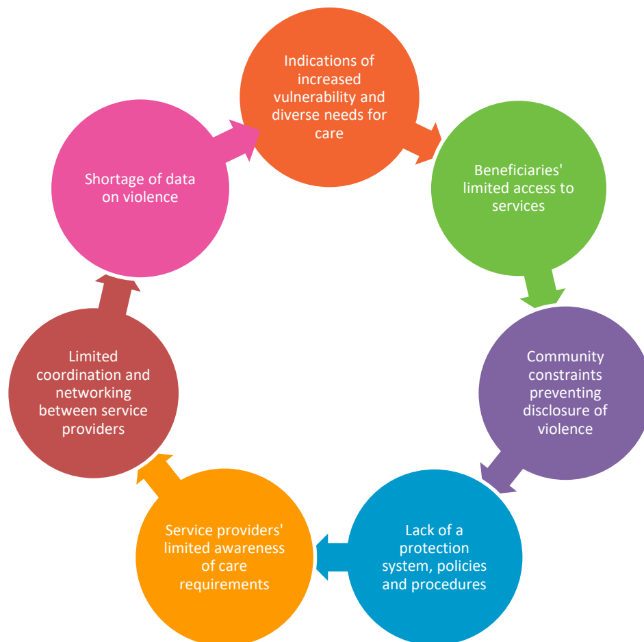
Figure 3: Major challenges and gaps in service delivery to women and girls with disabilities

Women with disabilities are excluded from the different surveys and data on violence in Palestine, leading to clear shortage of information and limited data on violence affecting them. This deficit is apparent in documents issued by PCBS, such as the 2011 survey on violence in the Palestinian society, which does not provide any data on this particular group, as well as other datasets and information produced by service providers.