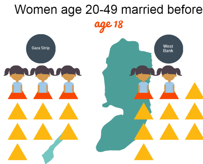
Figure 1 4

As illustrated in figure 1, two out of every ten women aged 20-49 were married before the age of 18 in the West Bank and this number increases to three out of ten women for the Gaza Strip based on PCBS data from 2014 2 . Cases have been detected where girls and boys were as young as 12 years when entering into marriage. When comparing the 2014 data with the 2010 3 , a decrease can be identified for Palestine as a whole, but also when looking separately at West Bank and Gaza Strip. This decrease is however misleading as pockets within both the West Bank as well as Gaza Strip have experienced an increase thereby leaving communities behind the national trend.